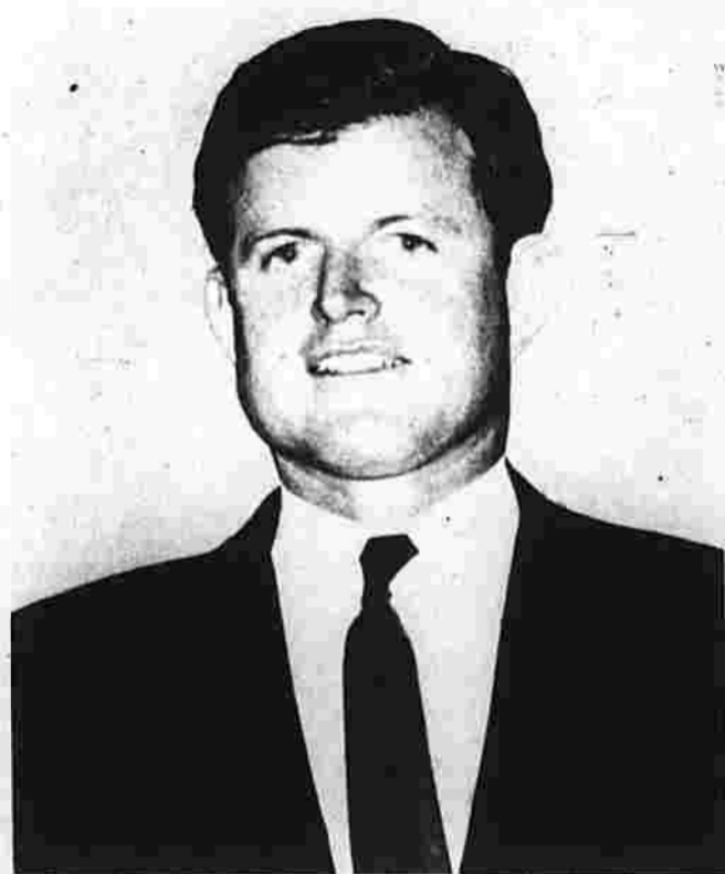
Sen. Edward M. Kennedy was ousted today as Democrat party whip, replaced by Sen. R. C. Byrd.

WASHINGTON (AP) — Senate Democrats in New York today depose Edward M. Kennedy as party whip today, as the 92nd Congress convened to face the president and an ambitious agenda of new proposals promised by President Nixon.