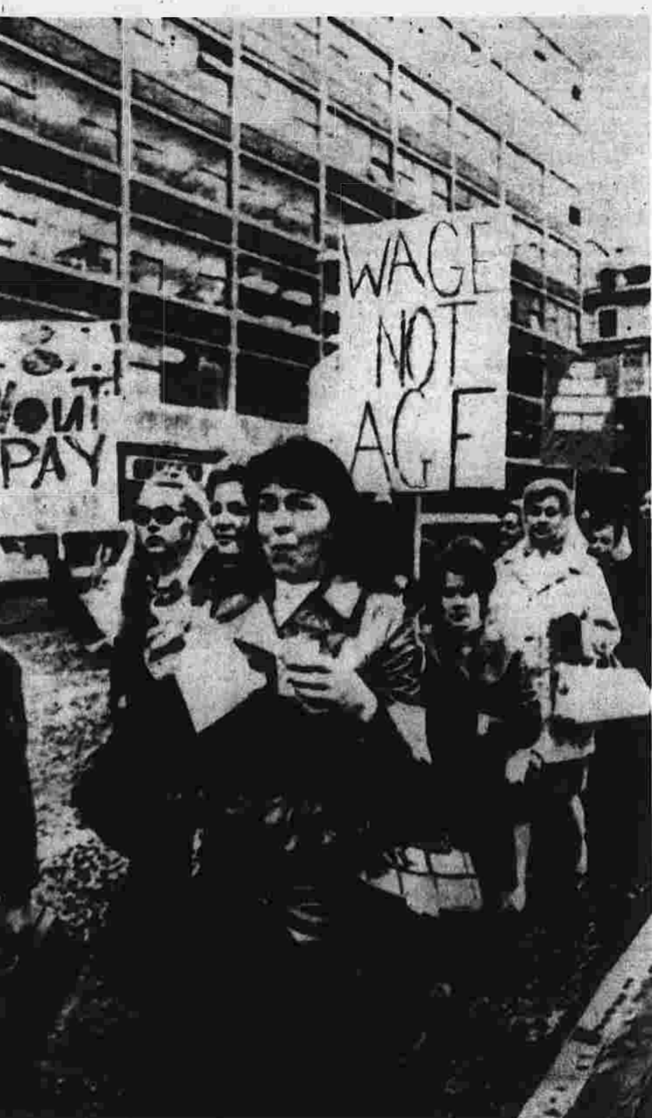
Woman on picket duty snatches sandwich and coffee as she marches with other postal workers down Ludgate Hill in London, on way to Hyde Park.

LONDON (AP) — A threat of foreign support for striking British postal workers grew today in 28 countries.